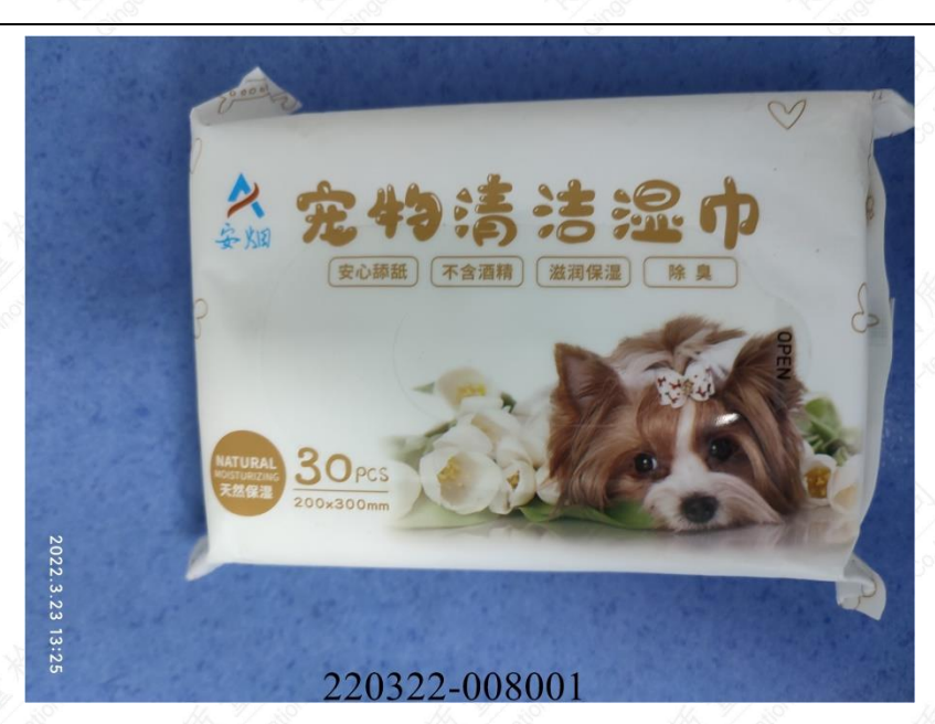
Figure 1 sample photo